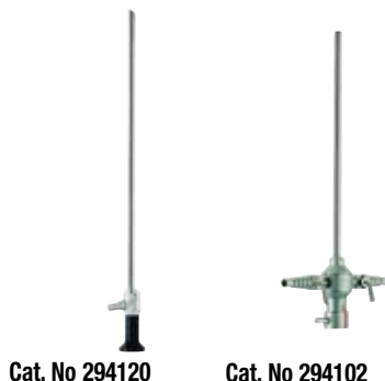
Cat. No 294120 Cat. No 294102