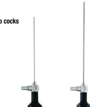
Cat. No 294100 Cat. No 294101

Grasping and biopsy forceps 3.5 mm Cat. No 294143