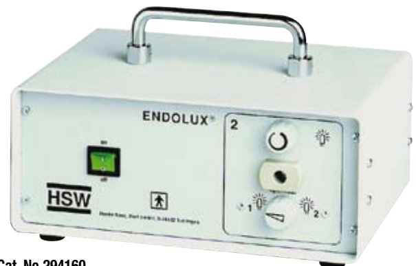
Cat. No 294160

Fibre optic cable. 1,800 mm x 3.5 mm Cat. No 294105